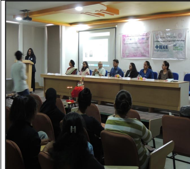
Inaugural of Workshop by Expert, Principal and Coordinators at CKPCET